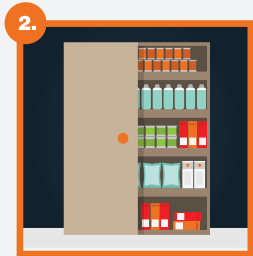
2. STOCK UP ON ESSENTIALS.