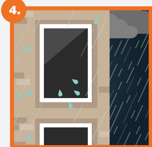
4. INVEST IN HURRICANE-PROOF WINDOWS AND GARAGE DOORS.

FOR MORE INFORMATION, VISIT WWW.GENERAC.COM/BE-PREPARED