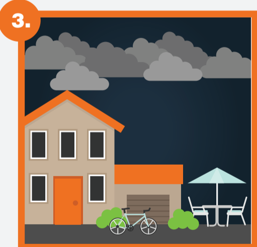
3. MOVE ALL OUTDOOR FURNITURE INSIDE PRIOR TO THE STORM TO REDUCE DAMAGE TO YOUR HOME.