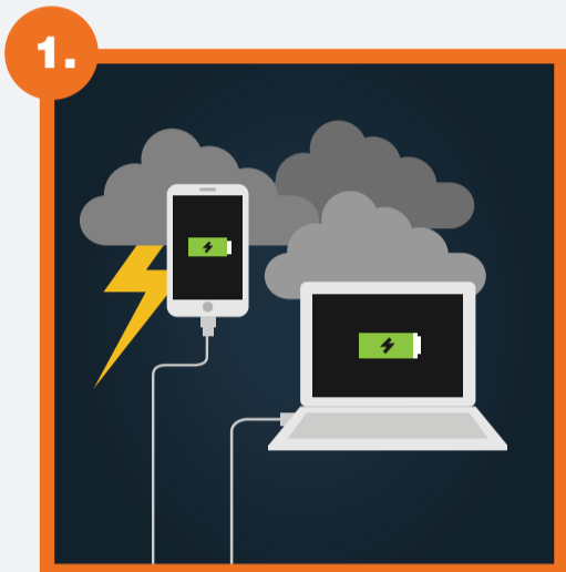
1. CHARGE YOUR ELECTRONICS BEFORE THE STORM HITS.

Hurricanes are unpredictable, and the weather man can only tell us so much. For hurricane season, Generac offers some tips that can help you and your family stay safe and your home stay powered during treacherous weather.